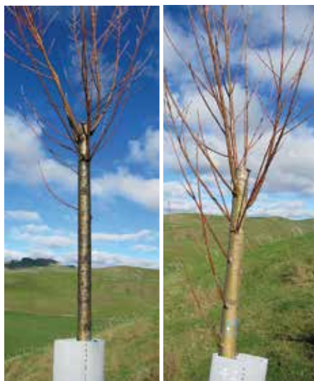
Figure 4. The blackened stem of an unsprayed 'Tangoio' willow tree (left) and the adjacent sprayed tree (right), in May.

willow aphid. The clusters of aphids on cultivars of this species are smaller and the stems of the trees show less stem blackening from the growth of mould on the honeydew, compared with other tree willows. The S. matsudana × alba cultivars, such as 'Tangoio' and 'Moutere', also have good tolerance of the giant willow aphid, but have larger clusters of aphids and more stem blackening. The S. alba and S. × fragilis (crack willow) cultivars are generally tolerant of the giant willow aphid, but have shown larger numbers of aphids, and more stem blackening, as well as some branch dieback in younger trees during drought conditions in summer.