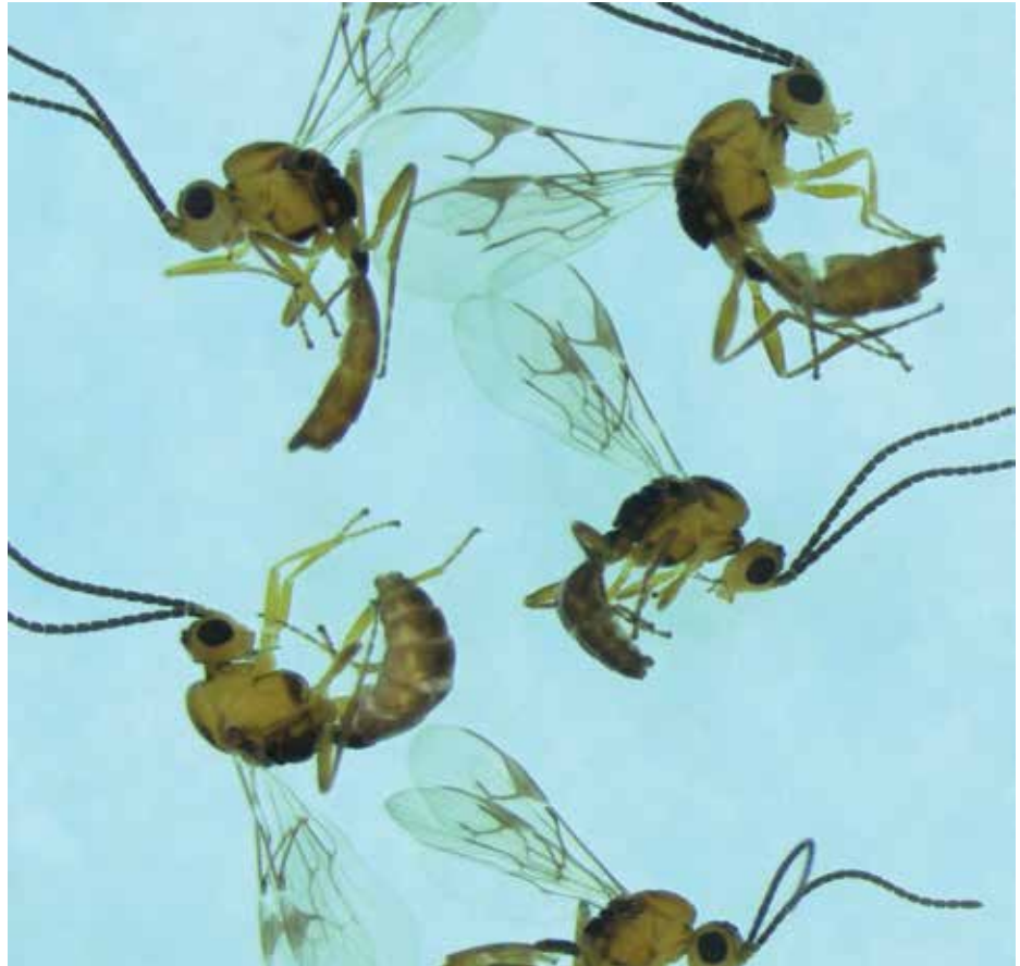
Figure 1. Pauesia sp., a parasitic wasp that kills giant willow aphid by developing inside it – one wasp per aphid.

The parasitoid is believed to be specific to GWA. It is highly unlikely that it will find any of New Zealand's native aphids palatable. However, once in New Zealand, the parasitoid will be transferred to Scion's PC2 invertebrate containment facility in Rotorua (Figure 2). Extensive testing to ensure the safety of our native aphid fauna will be carried out there. This is expected to take the better part of the next two years of this three year programme.