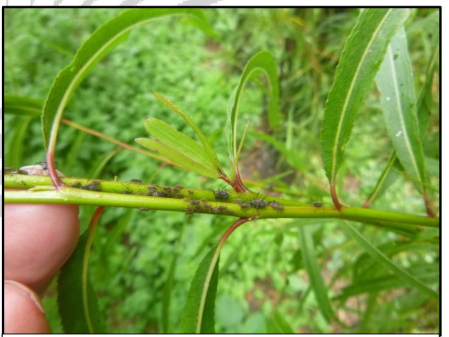
Figure 2. Giant Willow Aphid

The presence of sooty mould from giant willow aphid feeding can provide a major summer food source for wasps. Replacing willow shelter with more desirable species (e.g. sheoke Casuarina cunninghamia ) will assist with long-term control. Monitoring willows in late spring / early summer and trimming them before aphid numbers build may also prove effective.